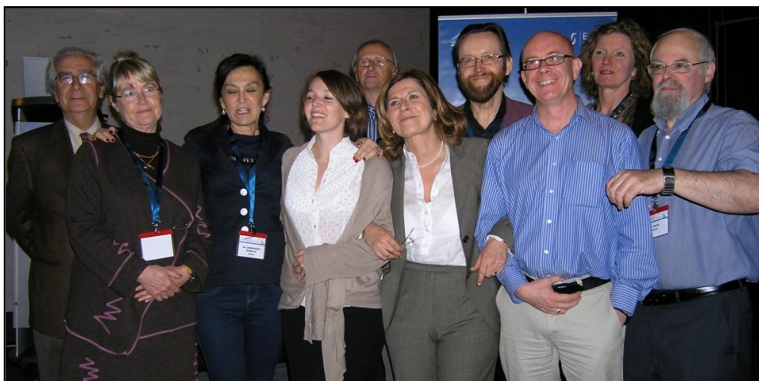
The new EFS Executive Committee (2010-2014)