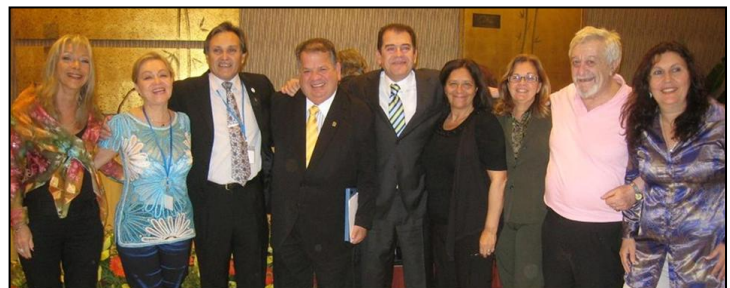
The new FLASSES Executive Committee for 2010-2014