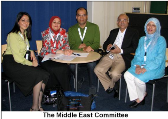
The Middle East Committee

Recently the World Association for Sexual Health established a Committee focussing on the Middle East. All members of the Committee come from Muslim countries, with representatives from Bahrain, Iran, Lebanon, Egypt and Pakistan. The purpose is to promote sexual health in Middle Eastern countries. Part of the Committee's brief is to assist sexual health professionals to develop their own associations.